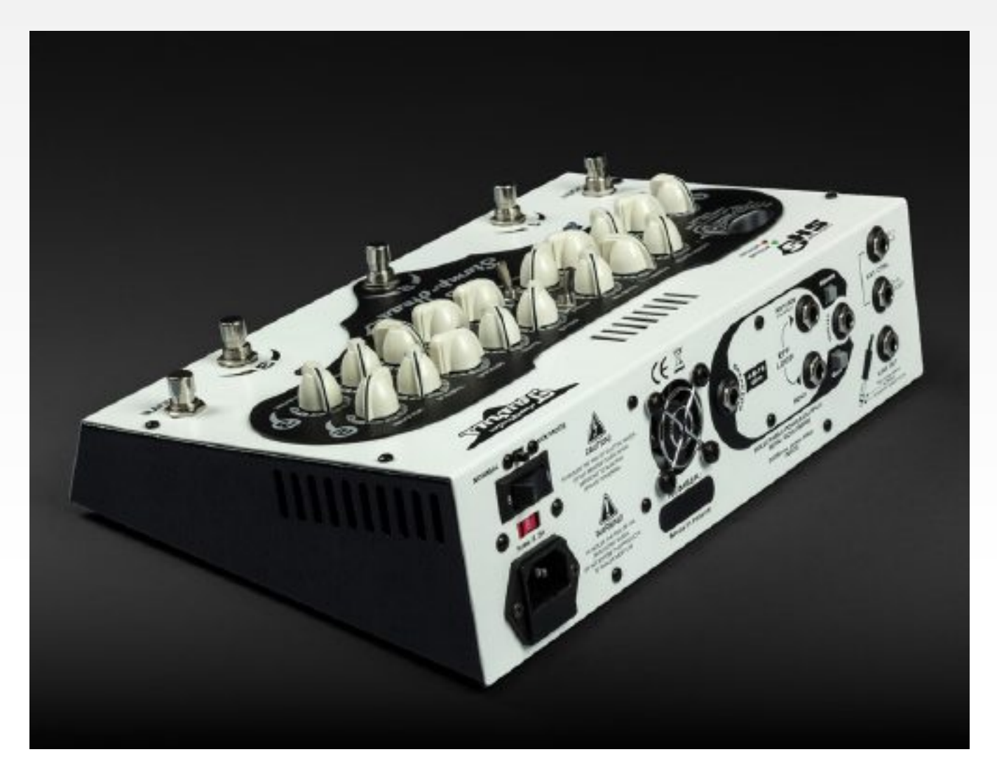
8 and 16 Ohms, the line out, serial effects loop, external control inputs for channel selection and boost switching plus a power (90W/40W) switch and a selectable +6dB input gain boost for low output guitars. The final switch selects between Normal channel operation and an

st interesting newcomers names in the amp business. Based in Poland, the company d winning converts around the world. Tom Quayle tries out what could well be their omp Head 5.